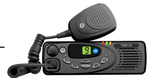
TM8110 – 10 channel mobile