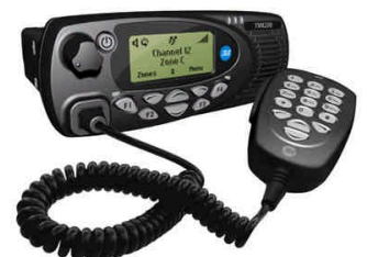
TM8250 – 1500 channel mobile