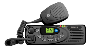
TM8115 – 24 channel mobile